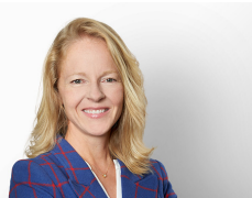
Vice President, Client Service & Business Development 416-360-0706 peace@nexusinvestments.com